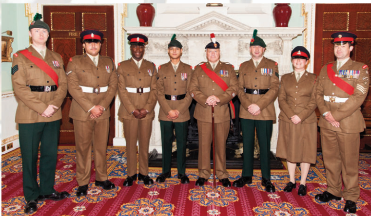
Our loyal Carpet Guard from Headquarters Company, London Regiment, on parade just before the Banquet. They have been providing the guard since 1989.