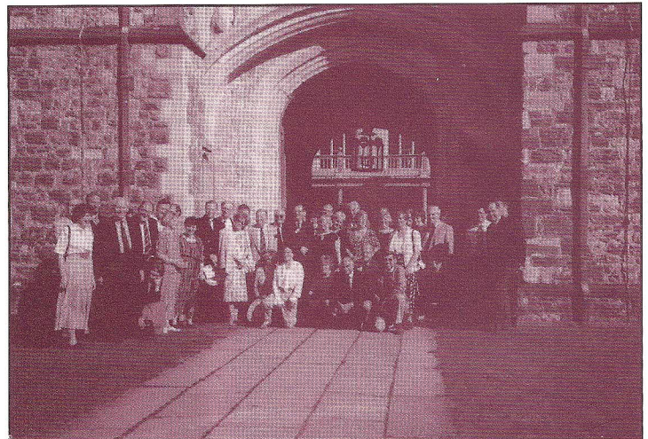
MASTERS RECEPTION AT KNOLE