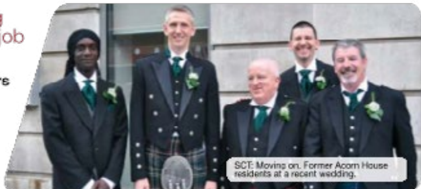
SCT: Moving on. Former Acorn House residents at a recent wedding.

SCT has worked in East London since 1965 and offers a range of high-quality support, rehabilitation and training services to people facing the challenges of homelessness, addiction, poverty or social isolation.