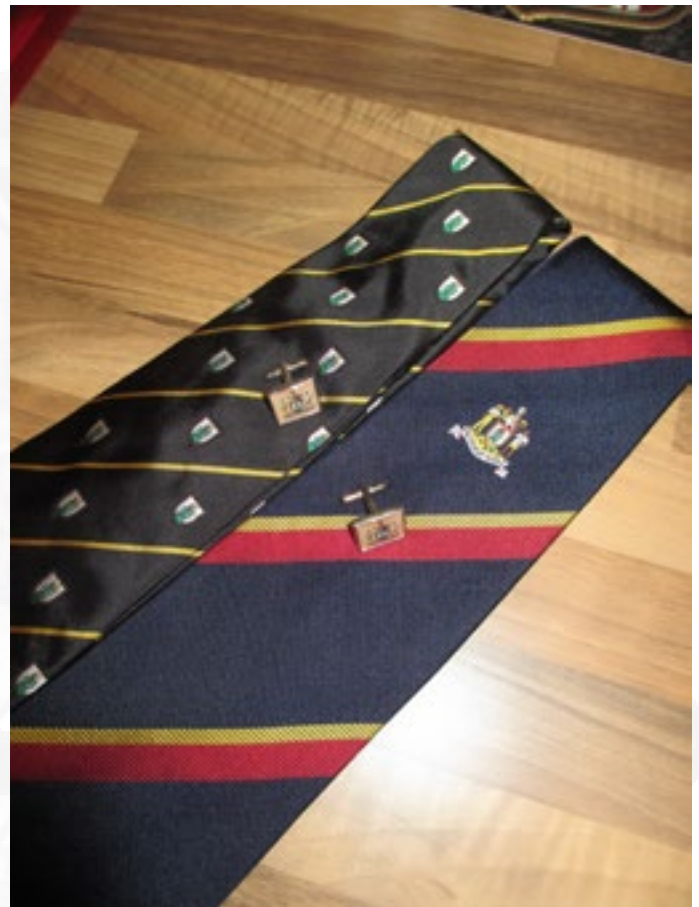
Company ties and cufflinks