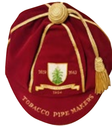
New Company Cap

All prices are inclusive of postage and packing. To purchase any item, please contact the Clerk at clerk@tobaccolivery.org